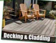
Decking & Cladding